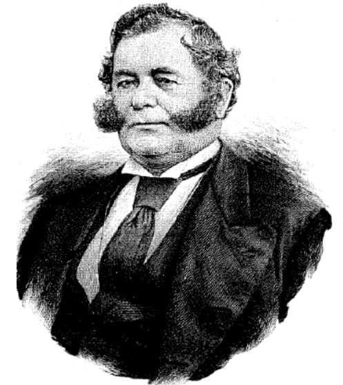
General Mariano Guadalupe Vallejo